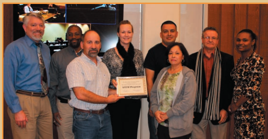
The Academic Senate nominated the RC STEM program for the Academic Senate for California Community Colleges (ASCCC) Exemplary Program award.