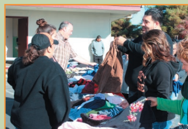
The Classified Senate coordinated a winter coat drive and distributed 350 coats to those in need on November 23.

Everyone is welcome to attend our Classified Senate meetings the 3rd Monday of each month at 2 p.m. (RC-PCR, MC AV1-207, OC-8, and WI AC1-149). Please feel free to contact any one of us for questions or assistance.